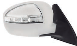
RET EXT ELT C/PSC CAPA PINT 28594 - LD - RF 28595 - LE - RF