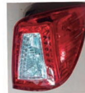
LANT TRAS C/LED C/SOQ 28584 - LD - RF 28585 - LE - RF