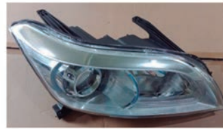
FAROL MANUAL C/LED C/PROJ 28582 - LD - RF 28583 - LE - RF