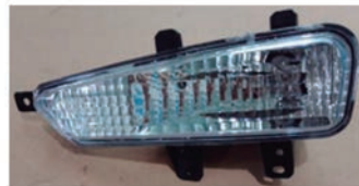
LANT DIANT CRISTAL C/SOQ 28586 - LD - RF 28587 - LE - RF