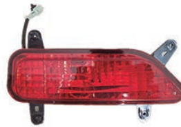
LANT P/CHOQUE TRAS C/SOQ 28588 - LD - RF 28589 - LE - RF