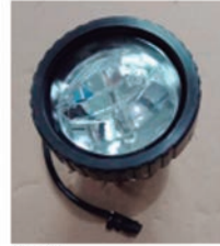
FAROL AUX 28590 - LD - RF 28591 - LE - RF