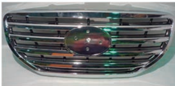
GRADE RAD PTO/CROM C/EMBLEMA 28596 - RF