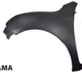
P/LAMA 28600 - LD - RF 28601 - LE - RF