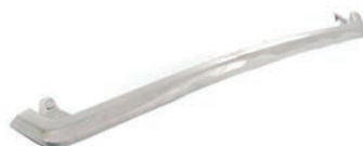
FRISO CAPO CROM 28267 - RF