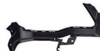
SUP FAROL 28272 - LD - RF 28273 - LE - RF