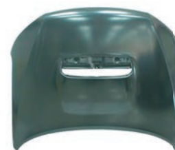
CAPO C/FURO 28281 - RF