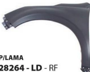
P/LAMA 28264 - LD - RF 28263 - LE - RF