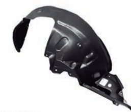
P/BARRO 28286 - LD - RF 28285 - LE - RF