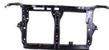
SUPORTE RADIADOR 29050 - RF