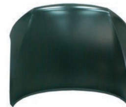
CAPO S/FURO 28280 - RF