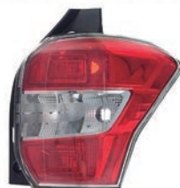
LANT TRAS 28278 - LD - RF 28279 - LE - RF