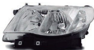
FAROL ELT C/MTR C/ENT XENON 27624 - LD - DEPO 27623 - LE - DEPO