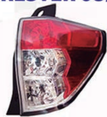
LANT TRAS 19926 - LD - DEPO 19927 - LE - RE VERMELHA - DEPO