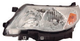
FAROL ELET S/MOTOR S/XENON 27622 - LD - DEPO 27621 - LE - DEPO