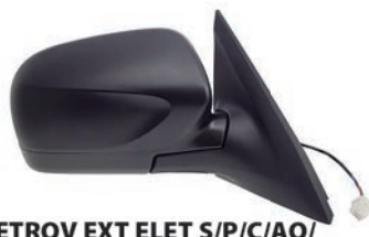
RETROV EXT ELET S/P/C/AQ/ SEN/TEM 25614 - LD - VIEWMAX 25613 - LE - VIEWMAX