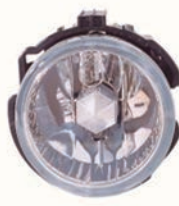
FAROL AUX 19990 - LD - DEPO 19989 - LE - DEPO