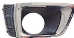
GRADE P/CHOQ DIANT C/MOLD CROM 28274 - LD - RF 28275 - LE - RF